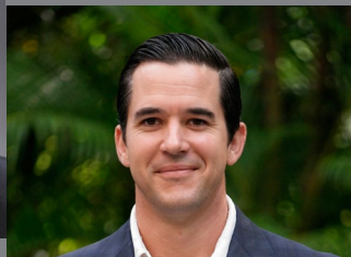
Leadership Under Fire, ANDY STUMPF, FORMER NAVY SEAL